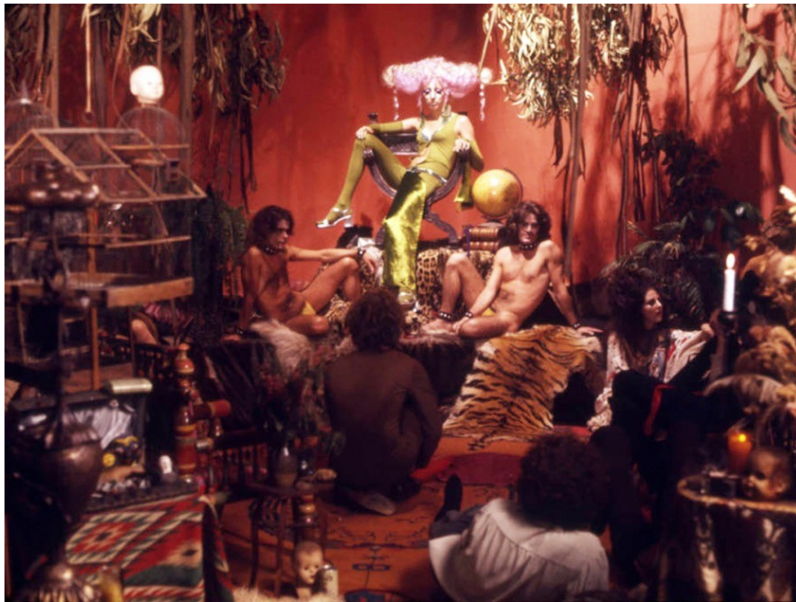
Luminous Procuress by Steven Arnold (1971)